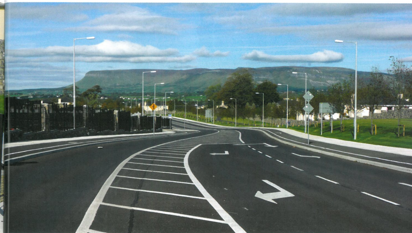
Western Distributor Road overlooked by Ben Bulbin.

In addition, provision is made within the contract for a fixed delay contingency, which does not entitle the contractor to an extension of the completion date, unless cumulative delay events awarded to the contractor exceed this contingency period. Even then, when this delay contingency is exceeded, the contractor is not automatically